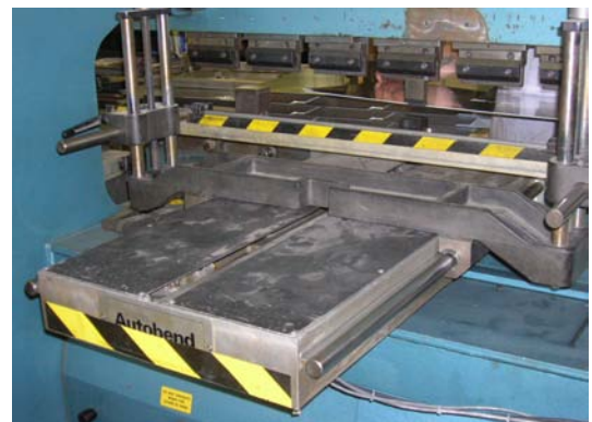
Older model S4 Hurco® mechanical retrofitted with Automec cables

Check with us for some very satisfied customer references. Click on UPGRADES on our home page at www.automec.com to get more information about the upgrade program.