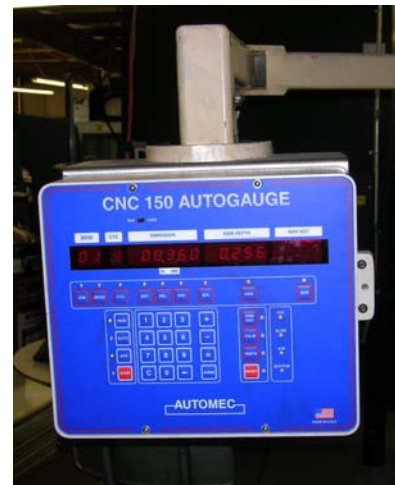
Automec CNC150 control adapted to an old-style Hurco® pendant

Single axis upgrades are priced at $4,950.00 and 2-axis are priced at $8,850.00.